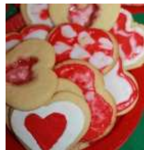
badges and sweet treats were on sale in abundance, enticing everyone to be generous on the day of love!