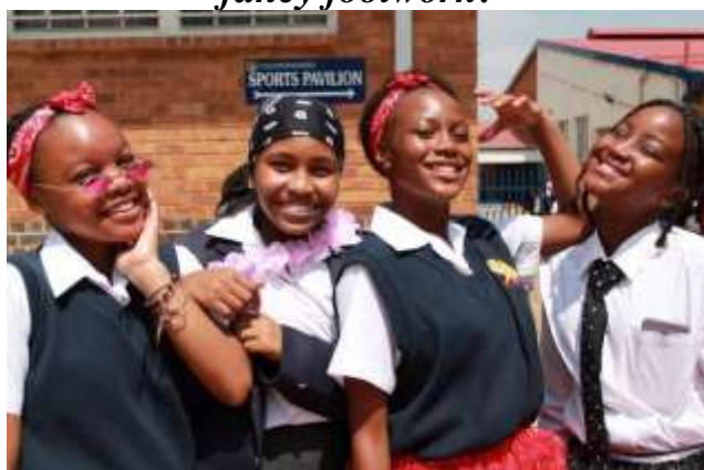
The 2020 Valentine's Day theme was "Pimp your uniform". The pupils had a lot of fun with this Matric Dance fundraiser and there were some very creative "uniform modifications".