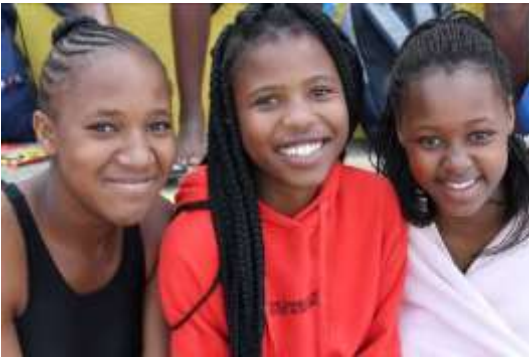
Grade 8s making new friends