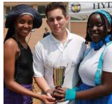
Grosvenor house captains receiving the winning house trophy