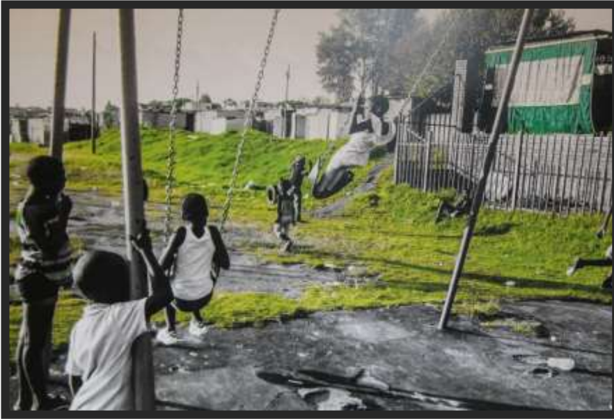
Below: One of Lebo Letwaba's photographic series