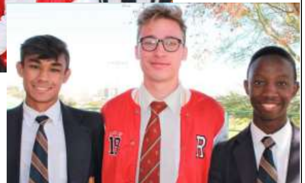
Right Boys Hockey Colours