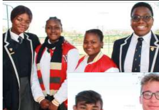
Left Dramatics Colours