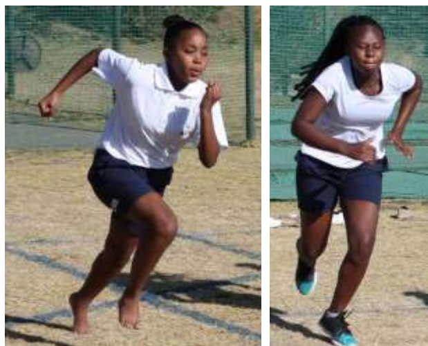
The Junior Girls at Athletics run-offs sprinting for a place