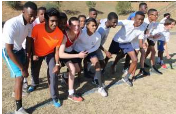
Our Athletics boys ready for action at training

The school athletics team training has begun and we wish our athletes strength and speed at their forthcoming events. Several athletics meetings will be held here at Hyde Park High School – come and support your friends and school and cheer them on.