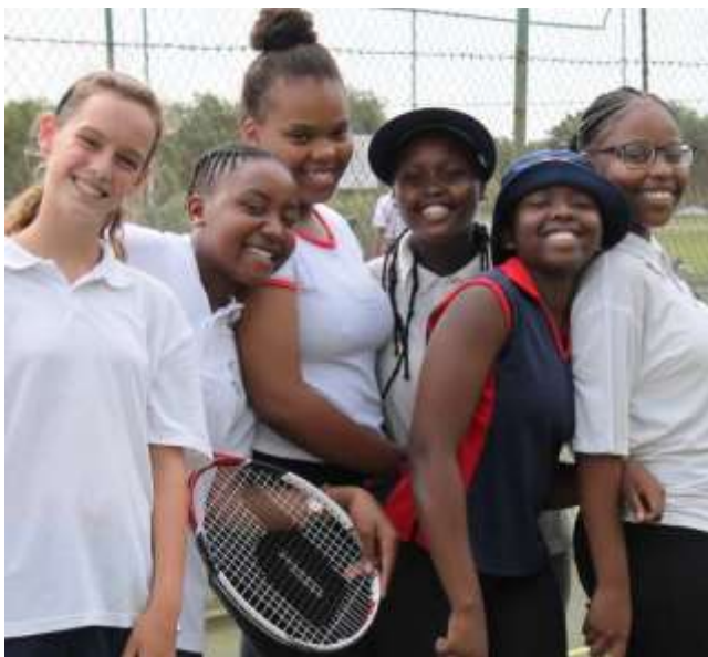
HPHS Girls at tennis practice

The season has been slow with several matches being cancelled and practice being affected by the weather. The players have however been enthusiastically involved in this extramural and hope to have some match results worth mentioning soon.