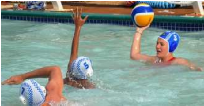
Waterpolo practice boys vs girls

The Girls Waterpolo team played against Kingsmead and Krugersdorp High recently and are proving to be a strong team to beat. They beat Kingsmead 7-6 and had a convincing win of 20-6 against Krugersdorp High.