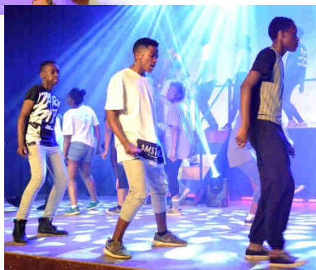
FUN AT BATTLE MANIA REHEARSALS!