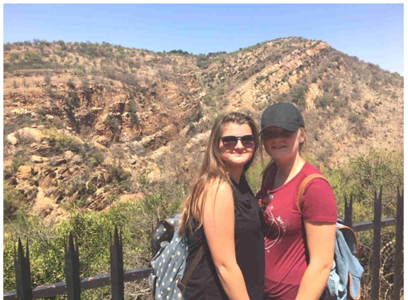
EXPLORING THE WALTER SISULU BOTANICAL GARDENS ON GEO TOUR!