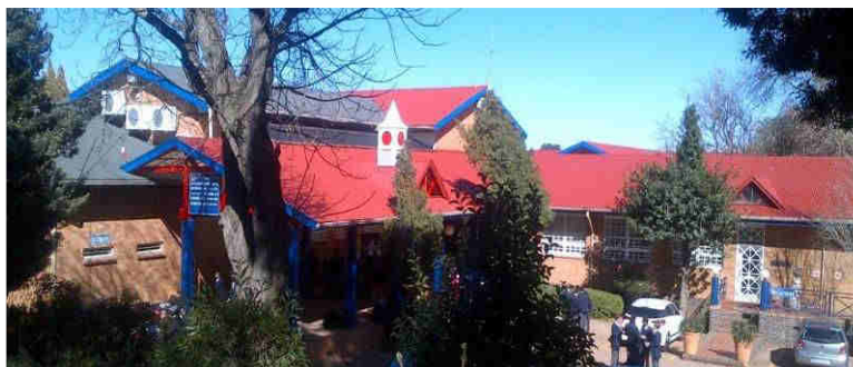
OUR NEWLY PAINTED ROOF

If you or your company or a friend would like to make a donation by providing funding, services or materials needed by the school, please refer to the list below. A Debit Order form can be provided on request for a monthly donation should this be your preference.