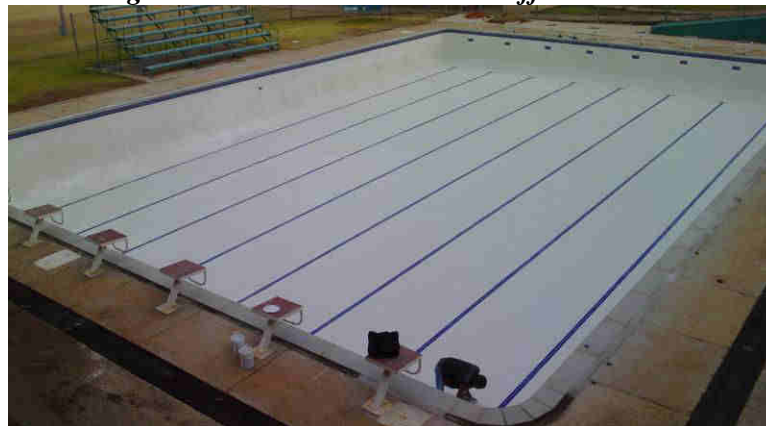
THE POOL HAS BEEN REFURBISHED