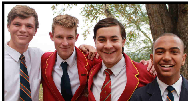
SWIMMING FULL COLOURS RECIPIENTS